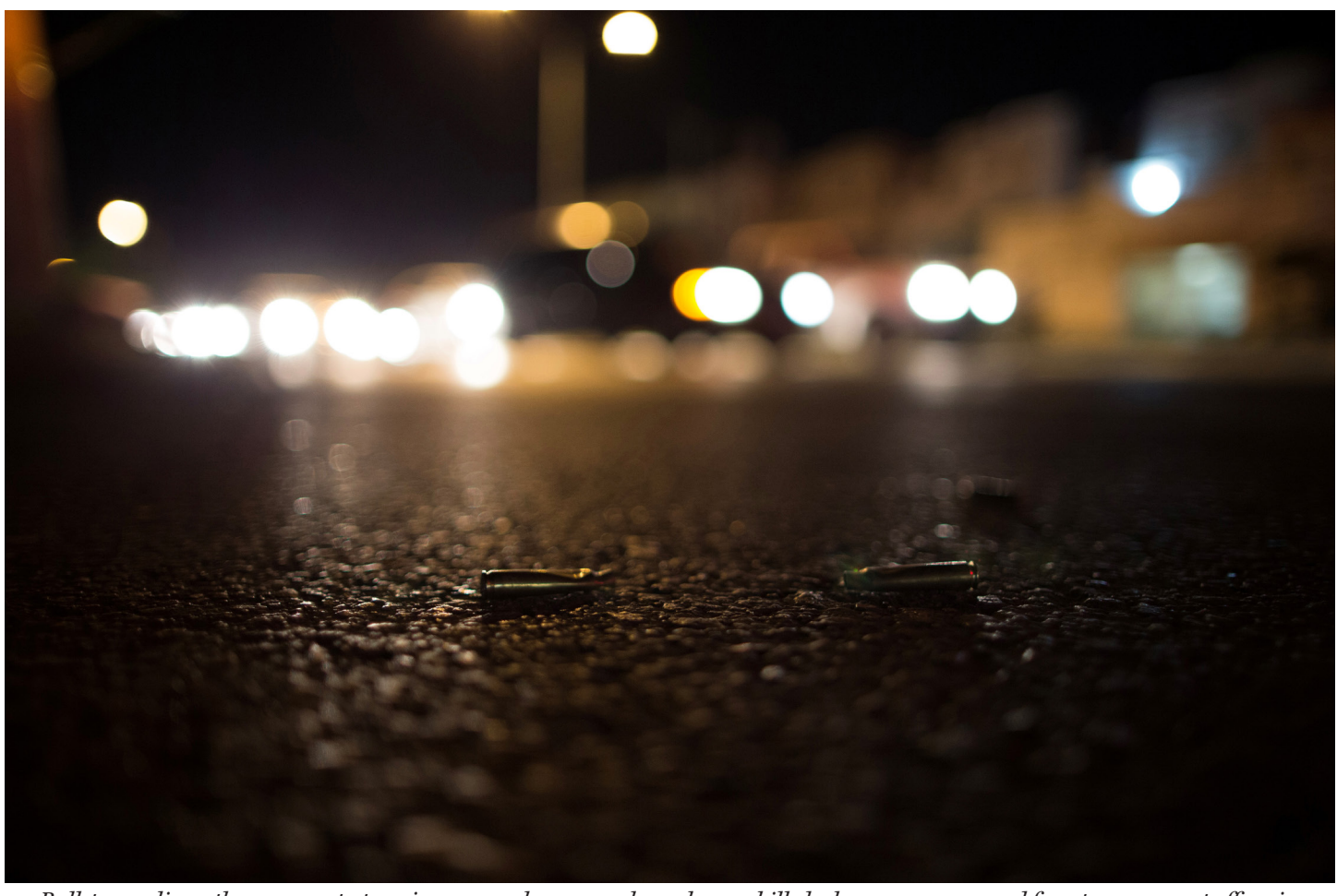
Bullet cases lie on the pavement at a crime scene where several people were killed when gunmen opened fire at government offices in Cancun, Mexico, on January 17, 2017.

the world its visions both for policing and how the organized crime threat looked as it pivoted away from the Cold War. ^{11} Organized crime went from being mostly a domestic law enforcement concern to one that was thoroughly globalized and required the resources of the military and intelligence agencies to thwart. ^{12}