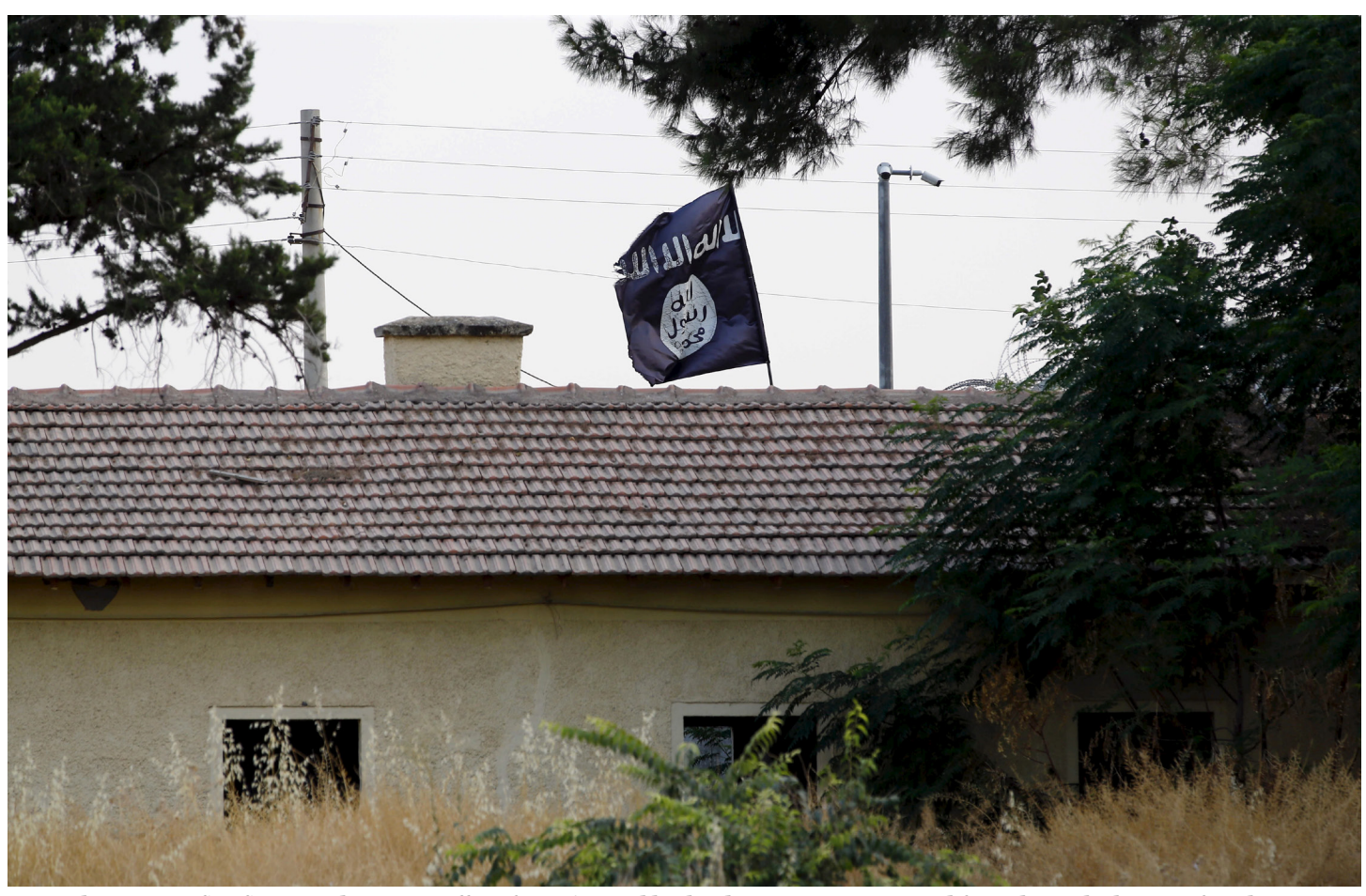
An Islamic State flag flies over the custom office of Syria's Jarablus border gate as it is pictured from the Turkish town of Karkamis, in Gaziantep province, Turkey, on August 1, 2015.

by Combating Terrorism Center researcher Daniel Milton, suggests that the group had at least 60,000 males in late 2016 alone on its payroll in Iraq, although this number includes almost 13,000 deceased 'martyrs." <sup>14</sup> <sup>d</sup> The total was derived from tallying unique identification numbers (census numbers) assigned by the Islamic State in internal documents, which were subsequently captured by the U.S. military.