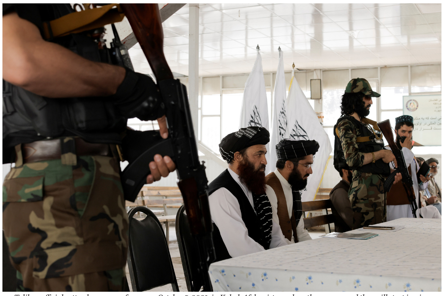
Taliban officials attend a news conference on October 5, 2021, in Kabul, Afghanistan, where they announced they will start issuing passports to its citizens again following months of delays.

quash the resistance. Though the fight briefly expanded into nearby Baghlan province, where partisans took up arms and seized several districts, by the last days of August 2021 the Taliban had already moved deeper into the Panjshir Valley than they ever had in the 1990s. By August 31, the last of U.S. and international forces had departed, leaving just as the Taliban attained as much of a monopolization of force as they may have ever possessed in Afghanistan.